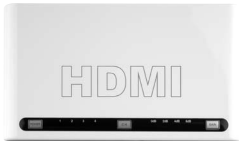
Model: AVS-HDMI21, AVS-HDMI41