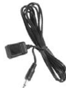
IR Receiver Probe (*optional)