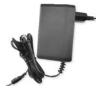
AC DC Adaptor 12V DC 500mA